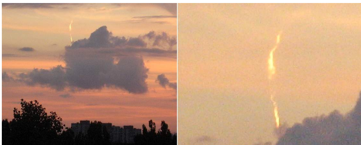
Figure 2: Bolide trace over Kiev June 31, 2013.