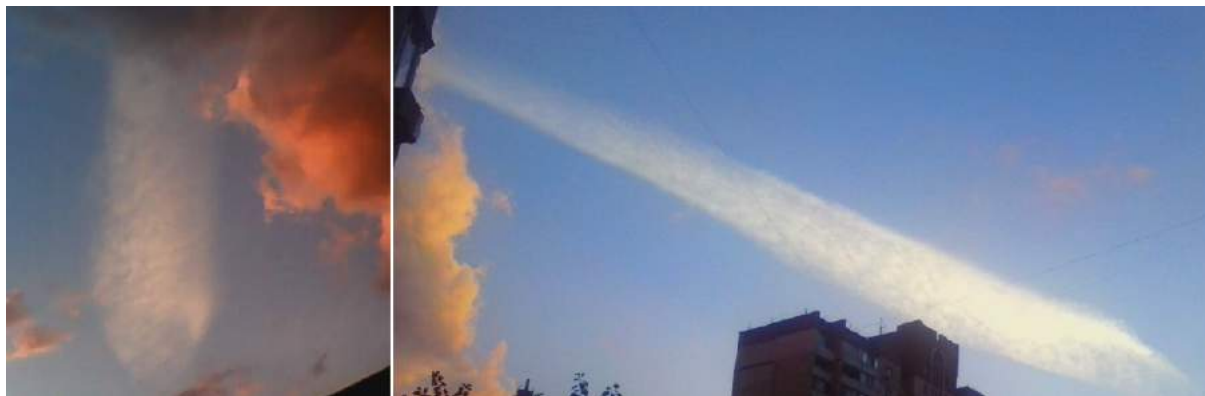
Figure 1: On the left – photo by Steklov A.F., right – photo by Dashkiev G.N.