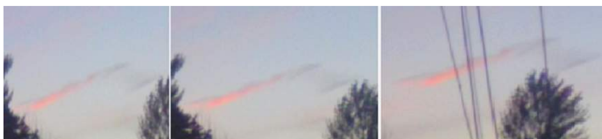
Figure 4: Variations of bolide trace over Kiev Region. July 08 2016. From left to right: UT 19.27.46, 19.27.57, 19.28.28.