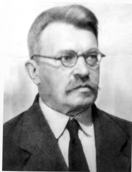
Александр Яковлевич ОРЛОВ (6 апреля 1880 – 28 января 1954)