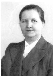
Gravimetric Observatory (1951–1969).