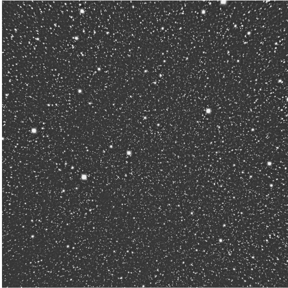
Figure 2: A frame after processing. The exposure time is 10 sec.