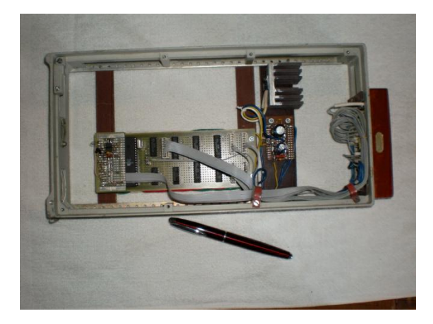
Figure 2: The upgraded device for controlling the operation of the telescope

The device has been operating as part of the radiometer for several years. It has shown reliable and efficient operation.